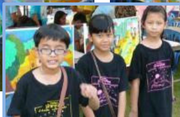
ers from the e School of hanaburi